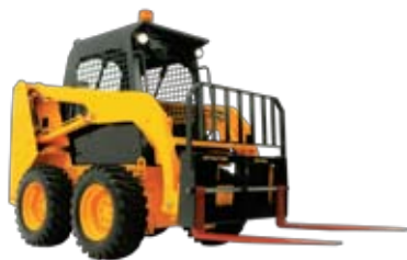
Mini Multi-tool Bar available